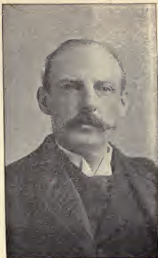
MR. F. MARION CRAWFORD.